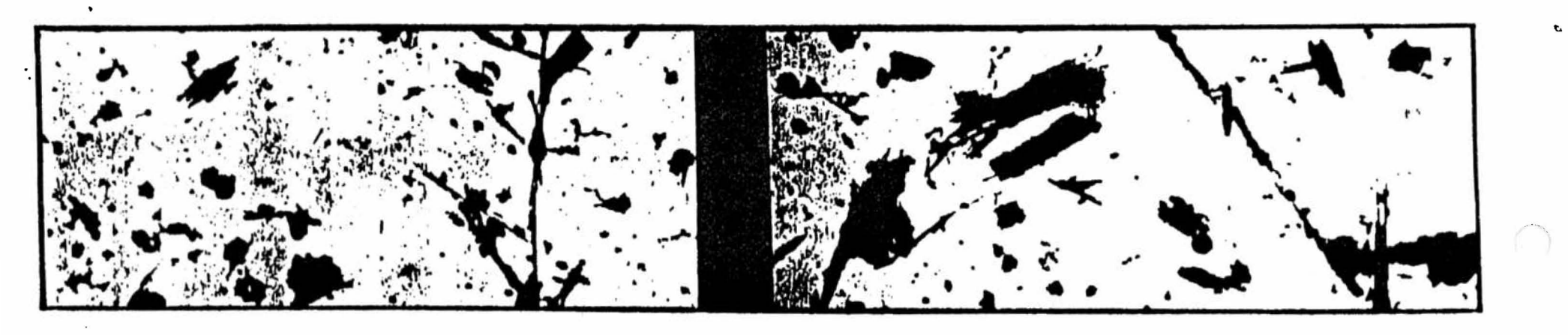
ELECTRON PHOTOMICROGRAPHS OF AIR-BORNE ASBESTOS DUST - MAGNIFICATION 5500 I